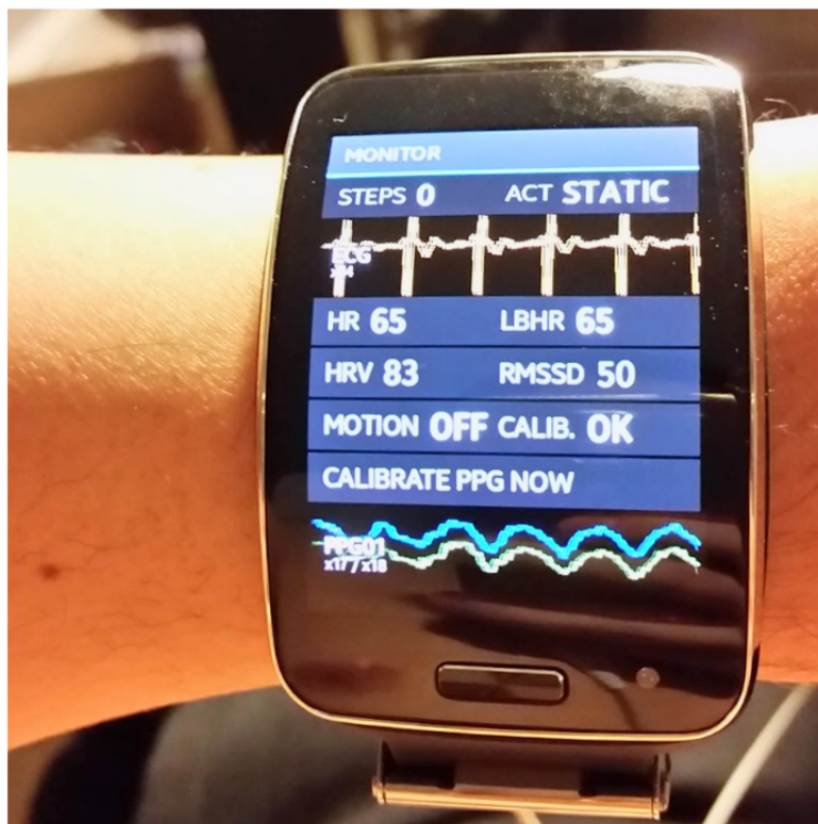
Figure 1. Samsung Simband 2 smartwatch showing simultaneous single-lead ECG (electrocardiogram) and PPG (photoplethysmogram) recordings.

The Samsung Simband 2 (Figure 1) is a wrist-worn mHealth device capable of performing continuous real-time monitoring of biophysical data, providing real-time user feedback and wireless, secure, and asynchronous signal transfer [25]. When connected to a secure wireless internet network, the Samsung Simband 2 passively uploads recorded data to ARTIK Cloud (Samsung Electronics), a Web-based cloud-based data storage platform used for research. For this study, Samsung engineers provided us with access to ARTIK Cloud and technical support. We generated a study identification number (ID) for each participant and entered this into the Simband 2 to link photoplethysmogram (PPG) pulse data to secure study data (Figure 2). PPG data identifiable only based on study ID was uploaded to the ARTIK Cloud using a secure connection. Investigators at the University of Connecticut (UConn) group who were blinded to the participants' rhythm status performed offline rhythm analysis using the real-time realizable algorithm.